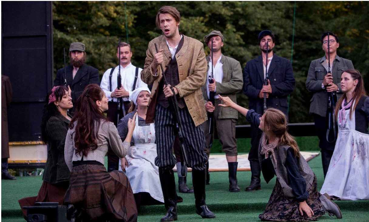
"Der Freischütz" (2018)